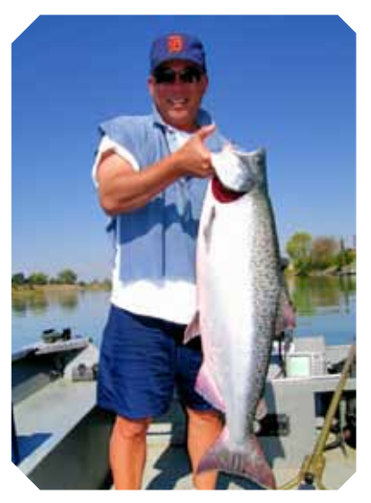
The Sacramento River is one of the nation's top salmon fisheries with fish in the river from mid-July through December