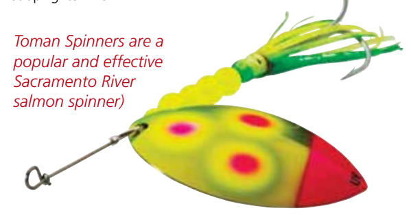
RIGGING TIP: When downstream trolling, use a rod with a slightly faster action than you'd normally use when fishing plugs – the fish often pick up the lure and swim towards the boat and you'll miss these "slack line" bites with a soft rod.

To rig up, slip your main line through a quality barrel swivel and then add 2-4 plastic beads and then tie another swivel to the end of your line. To the sliding swivel, run 12 to 18 inches of line and to the end, attach a snap. This is where you'll clip your sinker (1-4 ounce cannon ball style). To the open eye of the swivel on the main line, run a two-foot section of 60-pound mono and then tie in a bead chain swivel. From there, another two feet of 40-pound mono goes down to your lure. Don't use anything less than 40-pound, as the spinner will quickly twist up lighter line.