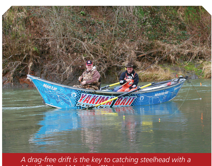
A drag-free drift is the key to catching steelhead with a Maxi Jig™ and Maxi Float™ rigging.

by feel, you'll need to keep tabs on your bobber at all times. When your bobber goes down/disappears (signaling a fish has taken your jig) you must quickly/immediately set the hook. In all cases, a dragfree drift with your float moving at, or a bit slower than the river current is critical to success